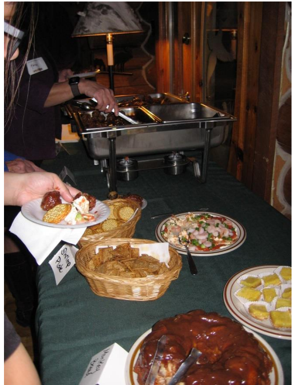
Fun, Food, and Conversation